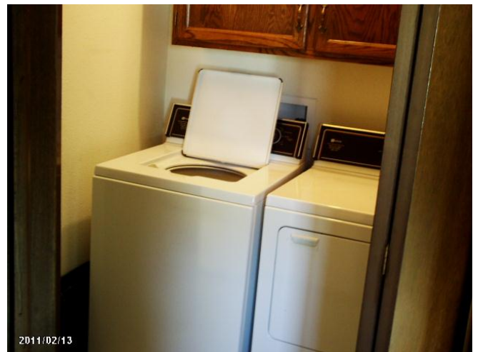
Laundry Area with Washer & Dryer