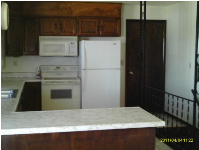
Kitchen with Appliances